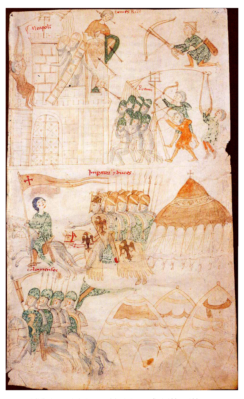
Bibliothèque de la Bourgeoisie de Berne, Cod. 120, c. 109r.