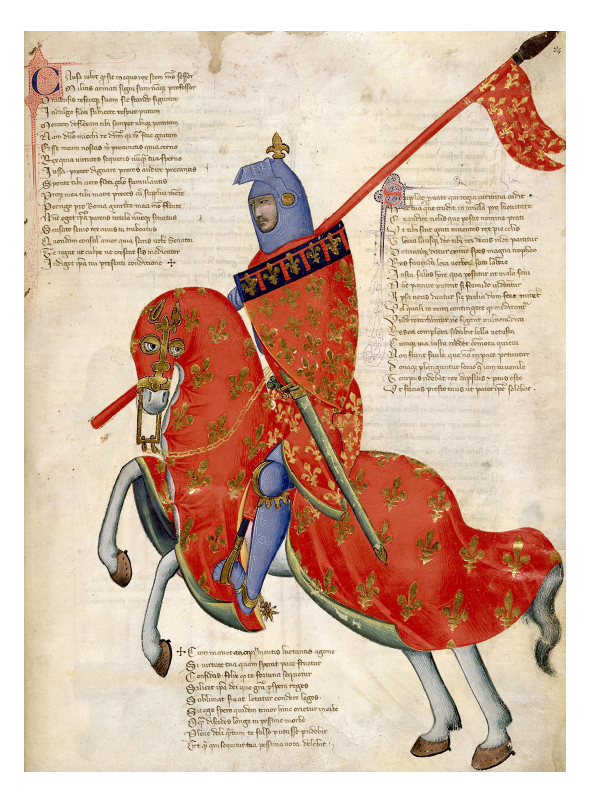
Convenevole da Prato, Regia Carmina, London, British Library, Royal 6 E IX, c. 24 r.