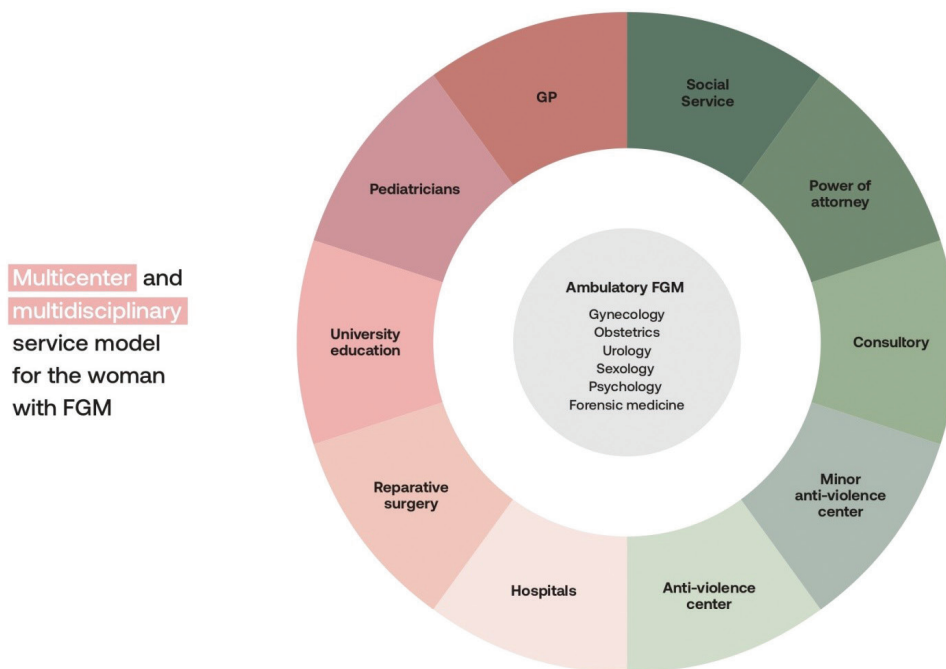
Fig. 1. Multicentre and Multidisciplinary Service Model for Women with FGM.

by Amref and from the discussion with international services already working in the field, it is therefore possible to ensure the personalization of patient care. Moreover, the system will ensure the long-term sustainability of the intervention (educational, health, psychological, social) implemented and comprehensiveness regarding all the needs that such a complex phenomenon as FGM entails.