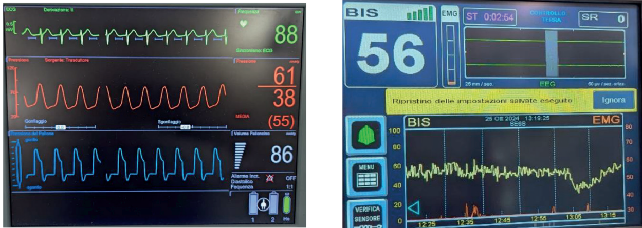
Figure 2. Physical quantities monitored routinely in patients in the operating room.

dle) goes beyond theoretical computer science and directly influences diagnosis and patient care. Through statistical methods, noise in physiological signals can be minimized. For instance, filtering techniques remove artefacts from heart rate or blood pressure signals, allowing for cleaner data that reflects a patient's true condition. Moreover, probabilistic models and statistical inference allow AI systems to extract insights from sampled data, estimate unknown parameters, and calculate the likelihood of specific outcomes.