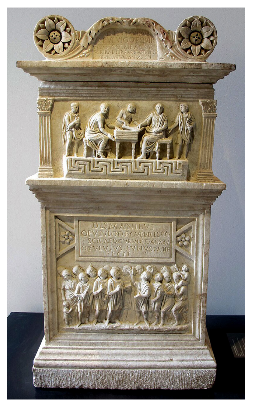
Ara detta degli scribi, del 25/50 d.C., dalla Necropoli di Porta San Sebastiano (Terme di Diocleziano) che rappresenta gli scribi addetti a registrare le delibere dei magistrati, Foto Sailko 2014, CC SA 3.0. Wikimedia Commons.