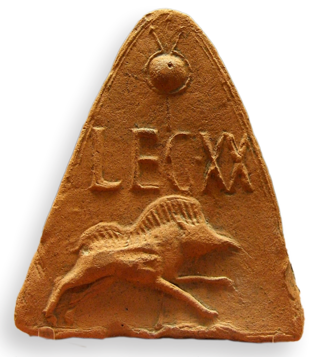
Società Italiana di Storia Militare