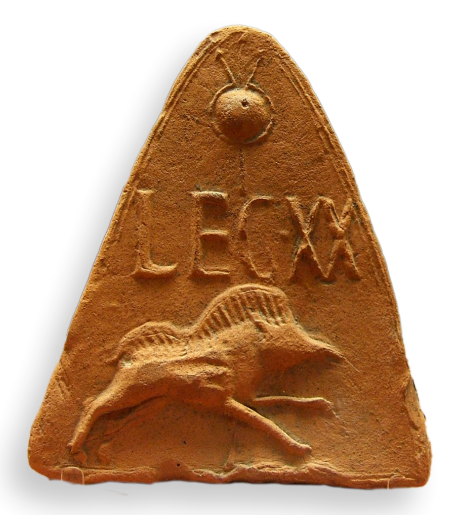
Antefissa in maiolica del II/III secolo d.C. col nome della Legione XX Valeria Victrix e un cinghiale, simbolo legionario, proveniente da Holt, Clwyd, Galles. British Museum, Londra. Numero di registrazione PE 1911,0206.1.