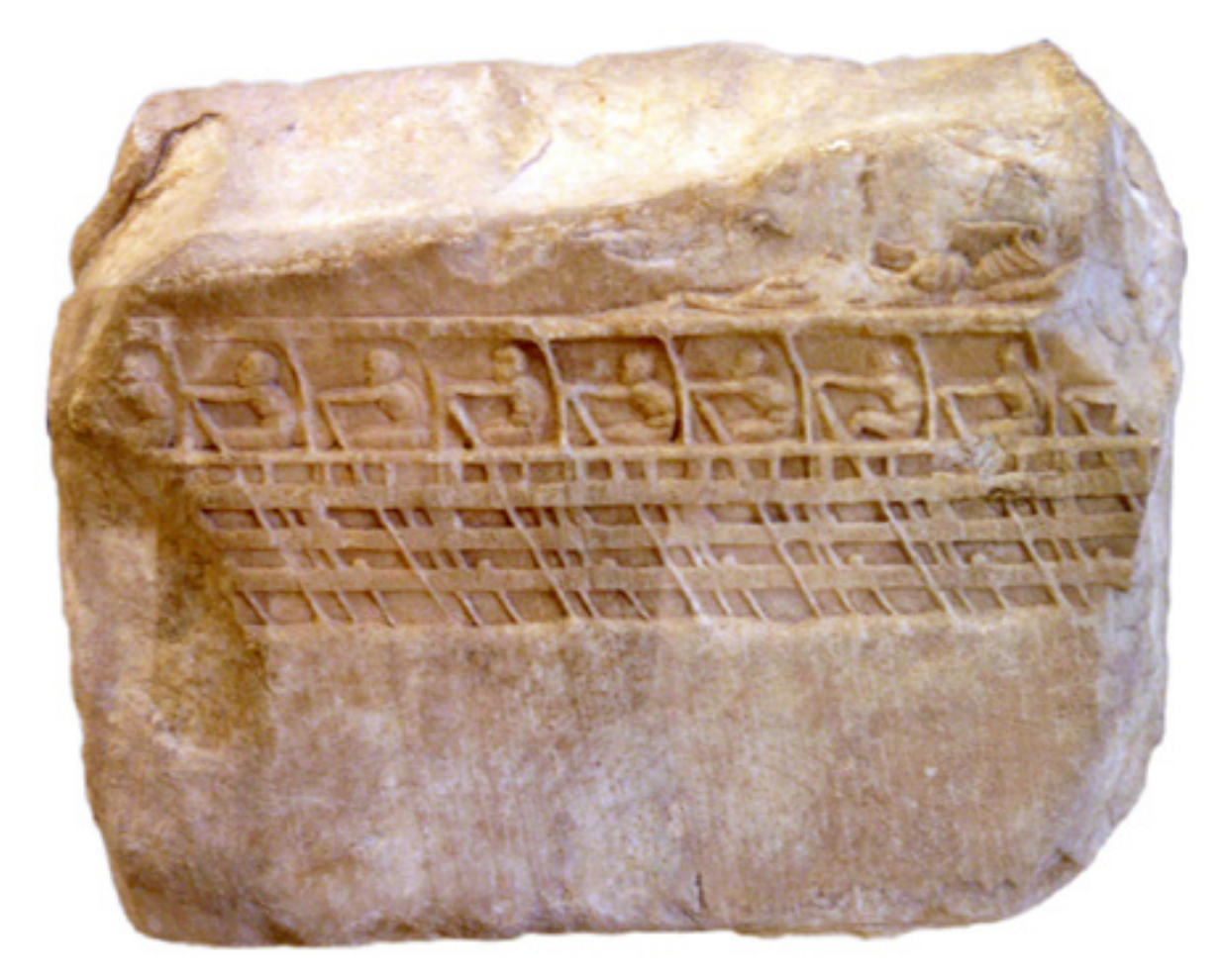
Fig. 1. Fragment of a bas-relief representing an Athenian trireme with 9 oarsmen, discovered in 1862 in the Acropolis near the Erechtheum by Lenormant and dated ca 410/400 BCE. Two other fragments of this relief exist in the National Museum and in apotheques. According to L. Beschi's reconstruction, the original composition represented a large trireme with its 25 rowers, the navigator and the commander. A young man on the right probably represents the hero Paralos, inventor of navigation.

nuanced case by case? Therefore, following a succinct review of the Athenian modus operandi in naval engagements in order to grasp what her enemies had to challenge, the aim of this investigation is to shine a new light on Greek naval warfare by considering the non-Athenian methodologies employed in battle scenarios.