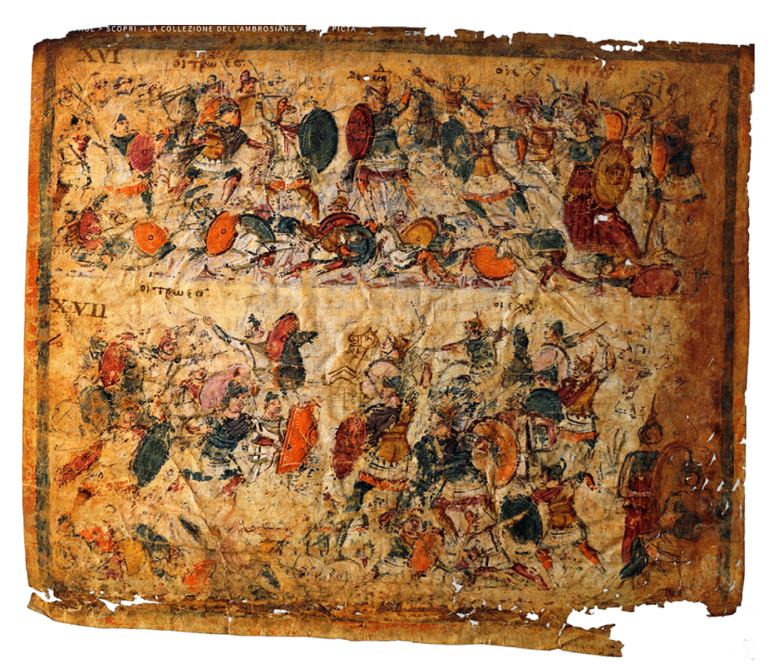
Fighting scene from the Ilias Ambrosiana (Milan, Biblioteca Ambrosiana, Cod. F. 205 inf.). Various fighting stances, with both sword and shield and spear and shield, can be identified.

be used as a mean to train in combat, as the Latins did. However, they were meant more as social occasions and as means to show the military prowess of the individual (a member of the aristocracy), while any aspect concerning training is not present in the sources.<sup>28</sup>