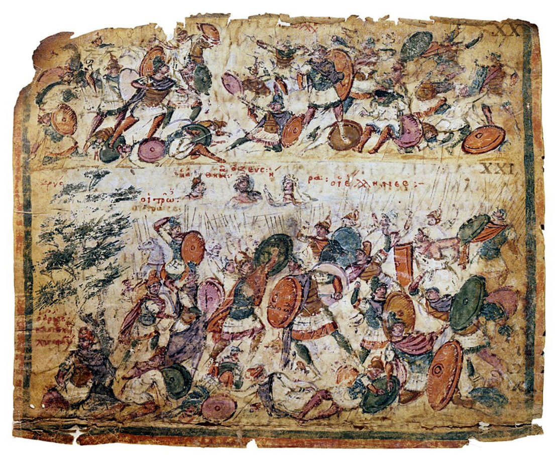
Fighting scene from the Ilias Ambrosiana (Milan, Biblioteca Ambrosiana, Cod. F. 205 inf.). Notice the fighting stance of the central figure, Diomedes, with the shield held near the body and the sword at hip height, the blade parallel to the ground.

Republican and Early Imperial Roman soldiers in combat by Polybius, Dionysius of Halicarnassus or Livy<sup>2</sup>. Also, written sources give us in various occurrences also descriptions of weapons which are not usually found in the archaeological record (e.g., shields from the Middle Byzantine period onwards, generally speaking), and such description may be crossed with extant visual sources.