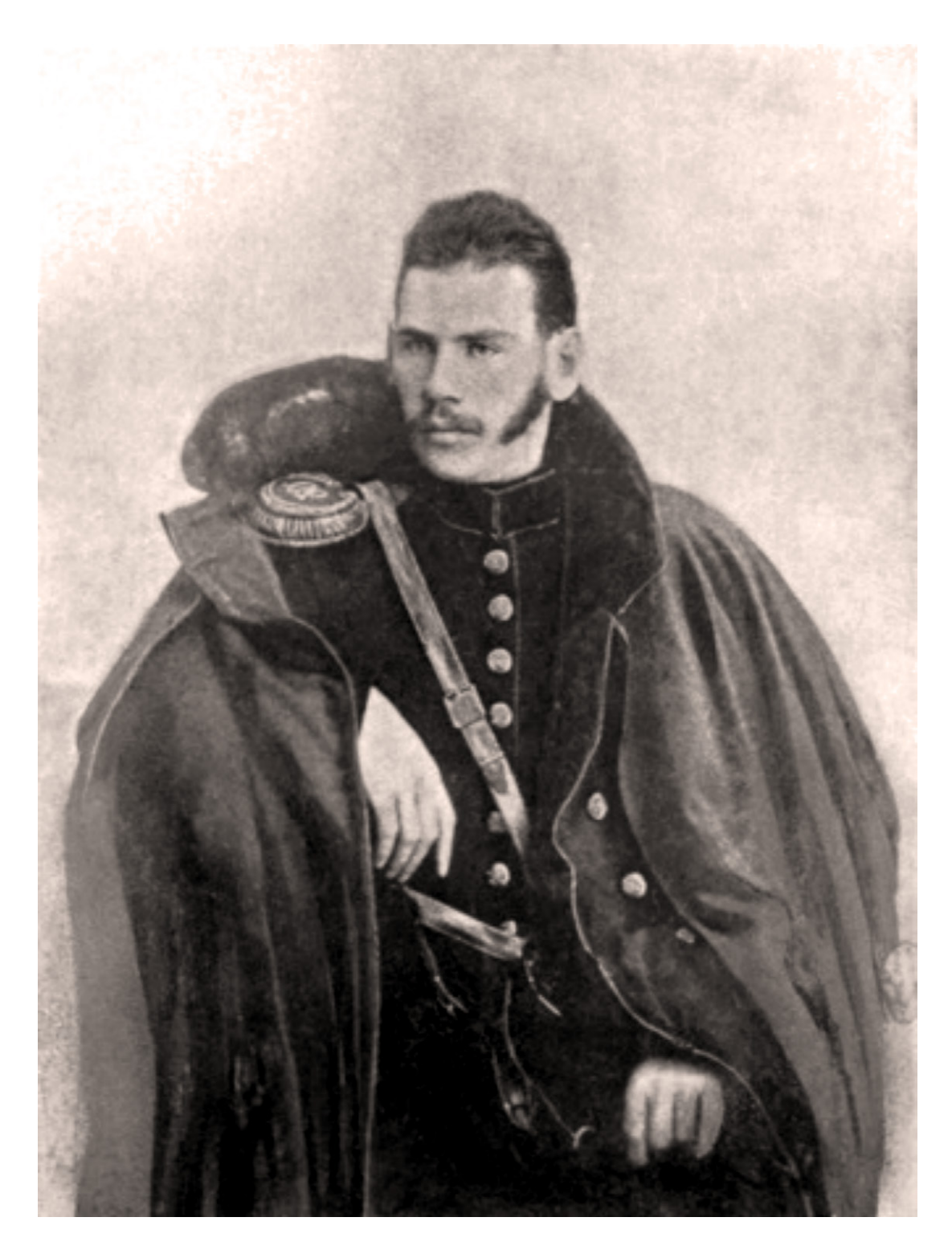
Lev Nikolaevič Tolstoj in uniforme di capitano d'artiglieria