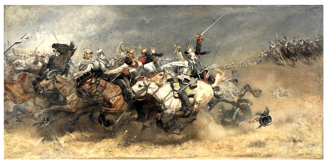
Aimé Morot, Rezonville, 16 August 1870, La Charge des Cuirassiers

repeatedly. Some of these actions resulted in heavy casualties, but they forced the Italian infantry to halt and deploy, thus achieving their tactical objective. With effective fields of fire limited by cover, the steadier riflemen had relied on traditional tactics: volleys from close order formations, or positions behind obstacles such as walls, at short range. In other instances, the infantry gave way. Early in the morning, a squadron of Austrian lancers caught Italian infantry in column; four out of five battalions fled. This was evidence to counter those who "would condemn large masses of cavalry to impotence," and a reminder that "the indefinite improvements in firearms" had yet to eclipse the human dimension of the battlefield. A French officer wrote of the Austrian troopers' achievement, "the moral effect, the shock, produced by their impetuous charge was such that the whole Corps was disorganised and paralysed for the rest of the day." 59