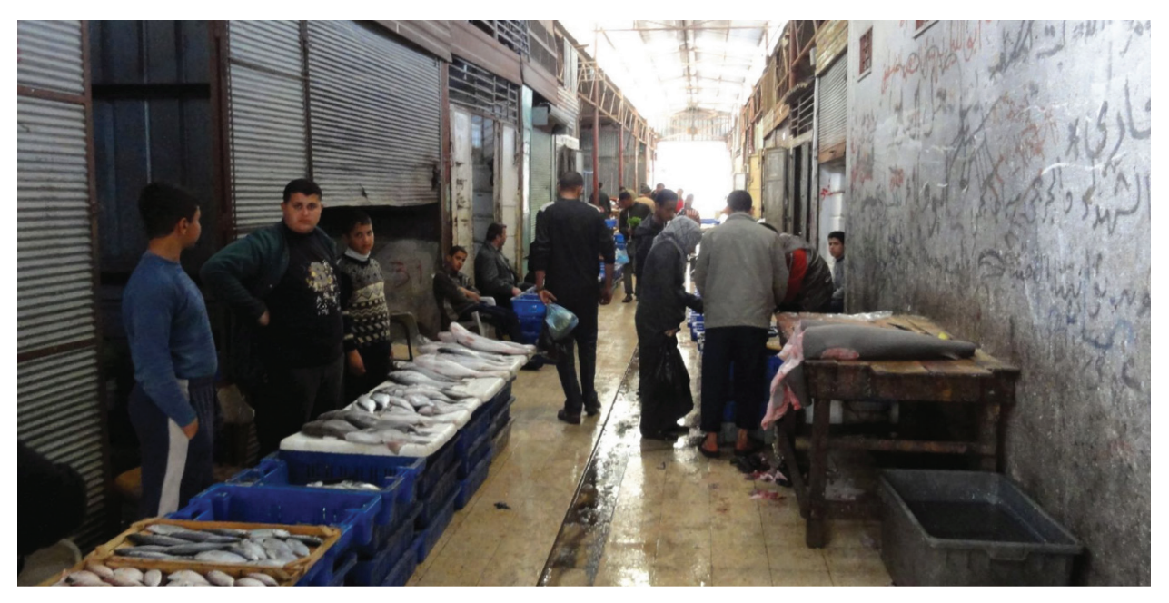
Fig. 1. Palestine is perhaps the most famous of all modern cases of "statelessness". What does it mean to be a national of a state without formal recognition, especially over the course of many decades and generations? This issue is considered in the bottom of the international political discussion, due to the long-time struggles in the Gaza's area.

viding sufficient housing, health, and social care (including childcare) support on release from immigration detention.