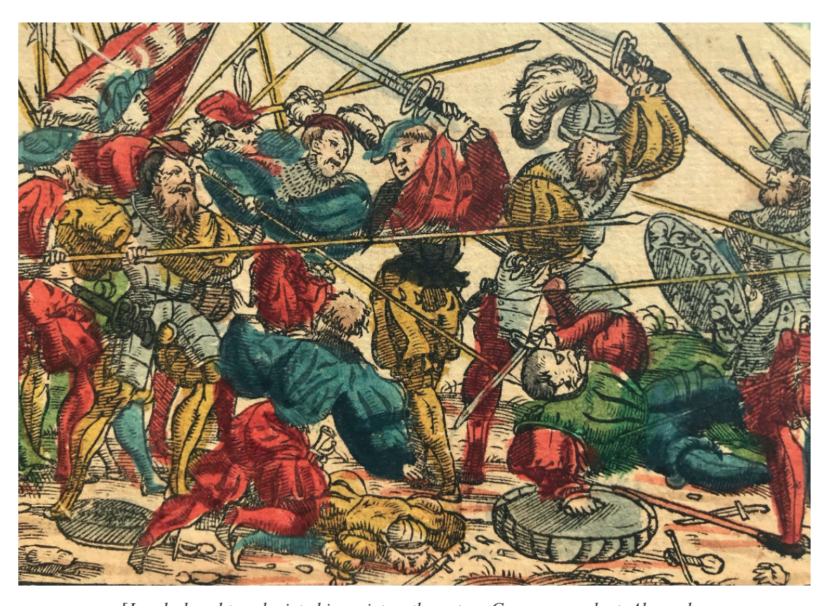
[Landesknechtes, depicted in a sixteenth century German woodcut. Alexander Querengässer's book illumines the medieval origins of early modern European mercenarism.].

tity in the Middle Ages (Brill, Leiden 2008) pp 43-60]. Casparis contextualizes mercenary enlistments of the Swiss from 1450 as components within a "larger evolving capitalist world economy" (p 593). The volatile demographics of the 1300s became the crucible from which the early modern military revolution would ultimately be formed. For example, the calamities of plague, coupled with the endemic afflictions of war, fomented labor emigration while simultaneously creating commercial demand for live bodies because of heightened mortality rates wrought by disease or as the consequent casualties of violent conflict.