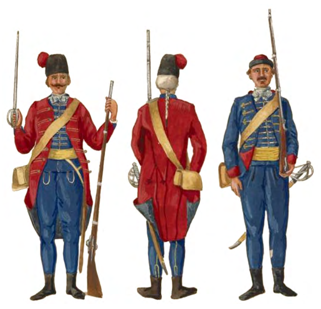
"Oltremarini" (Overseas) Regiments in Venetian service, nicknamed 'Schiavoni'