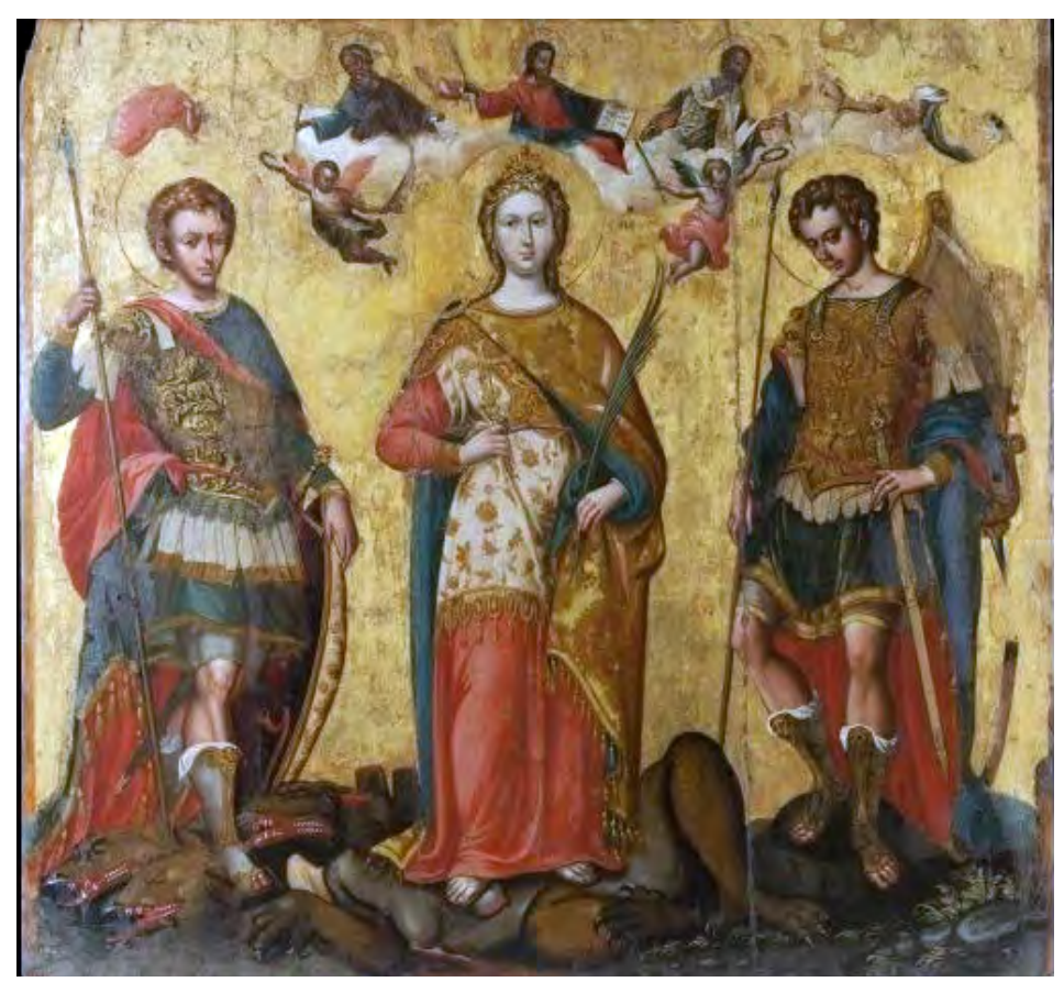
1 Icon (egg tempera on wood) of Saints Sergius, Justina and Bacchus, on whose feast day (October 7) the naval Battle of Lepanto took place; by the Cretan painter Michail Damaskenos (1584–1593). The author combined two traditions, depicting on the one hand the military Saints of the Orthodox Church Sergius and Bacchus, and on the other Justina, Saint of the Catholic Church and a patroness of Padua. The icon was transferred from Chandax (Candia) to Corfu after the Cretan War.

ry on the Republic's festal calendar: Giovanni Bassano's Beato virgo et martyr Iustina , which however appeared in print much later, in 1598. <sup>15</sup> The motet's text refers to Santa Giustina, whose name became inscribed in Venetian consciousness and memory as inexorably connected to the victorious outcome, since the