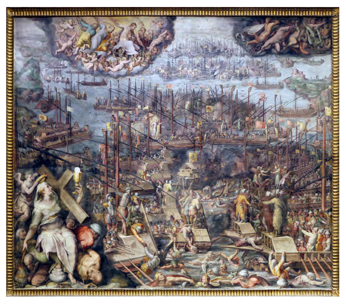
2 Giorgio Vasari, Battle of Lepanto , Sala Regia, Vatican Palace, photo by Sailko 2017. Source: Wikimedia Commons.

also denotes that these motets and masses were composed for some ceremonial occasion which called for the employment of larger forces, as certainly the commemoration of Lepanto would have been. Within the highly symbolic language of these settings, however, it is also possible that the unanimity in the choice of texture was not coincidental, but aimed at a heightened symbolic, albeit not verbal, representation of the Battle as Christ's victory effected via his divine guidance of the Christian forces.