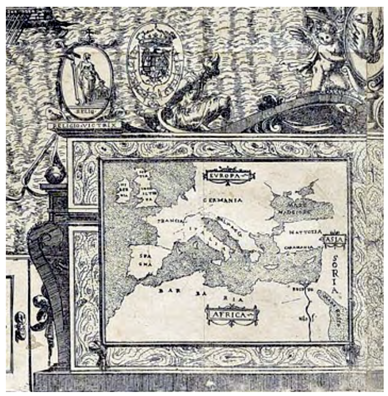
5 Disegno dell'armate, Christiana, et Turchesca [...] nell'andarse ad incontrare et il conflitto, Rome, Michele Tramezzino, 1572, detail.