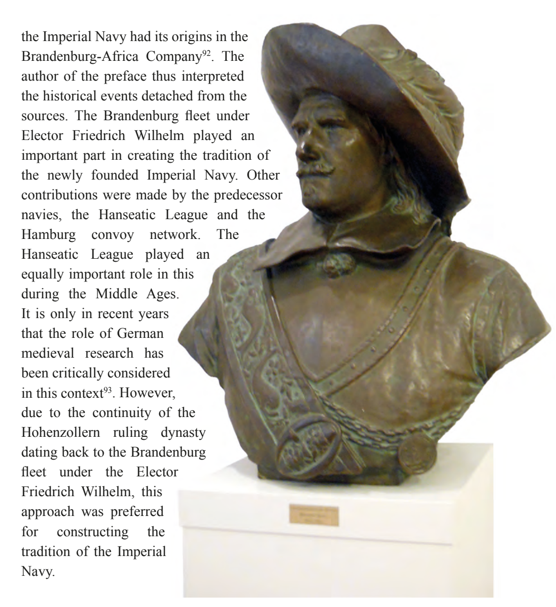
Portrait bust of Benjamin Raule, Wehrgeschichtliche Sammlung in Marineschule Mürwik