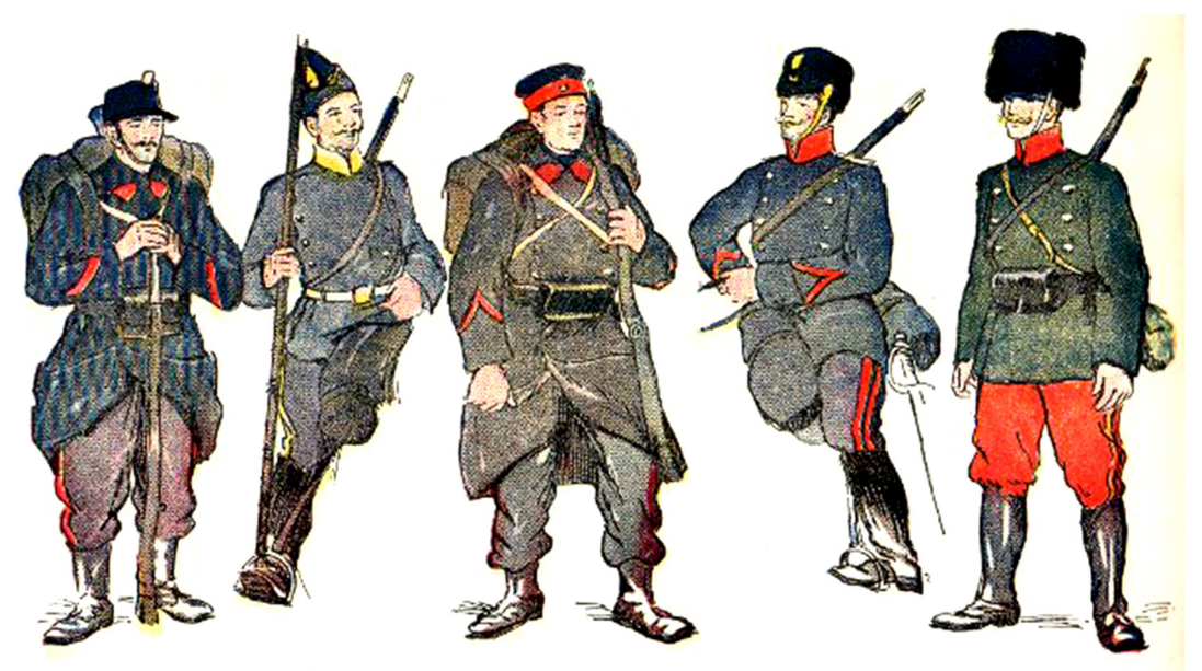
Assessing the Belgian Army

nually, to be selected by lot. Furthermore, the conscription quota had to be approved by parliament every year. The 13,000 recruits were to be supplemented by 3,000 volunteers – a number that was never reached. The state of the Belgian army's equipment was also deplorable. Until 1908 the artillery did not have guns with a modern barrel recoil. Of the 180,000 soldiers available to Belgium in the event of a war, only 80,000 men belonged to the field army, while the rest were assigned to reserve units and manning fortresses.<sup>51</sup>