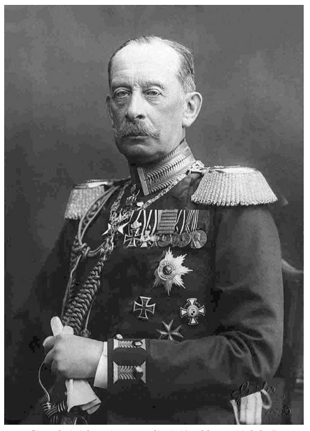
Graf Alfred von Schlieffen (1906)

The general staff's military intelligence branch played a central role in Schlieffen's decision to march through Belgium. It had meticulously observed and analysed France's fortifications along the French-German border and come to the conclusion that a rapid German advance through this defence system, which had been intensified since the 1870s, was not possible. The 4<sup>th</sup> department, being responsible for the observation of France and Belgium's fortifications, repeatedly devised attacks on individual French forts,12 but had always stressed that a rapid fall of the whole line was impossible. Other high-ranking officers in the general staff expressed sim-